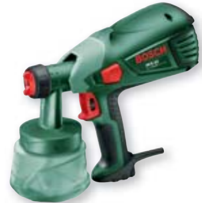
PFS 55 For small projects.

The new fine spray systems from Bosch are available in three versions: as a practical, handy spray gun, as a medium-sized tool that can be carried, and as a free-standing model that can complete larger jobs with ease. The spray system provides a suitable solution for every project. Here are the three tools that will enable you to achieve a perfect result with ease: